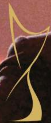
Salman Khan delights one and all at the Apsara Film & Television Producers Guild Awards.

"The Apsara Awards are presented by the fraternity which makes them truly represent the 'Perfect Choice'. As an award presented by the most knowledgeable and sincere luminaries of the film and television fraternity, it truly is a defining moment to receive an Apsara. By being the benchmark of excellence within the industry, the Apsaras are the embodiment of the human form reaching for the stars. The Apsaras will continue to be the one that every Indian film maker and actor dreams of achieving in his career and will be around to honour India's finest for years to come."